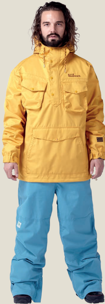
Buller Overhead [page 23]