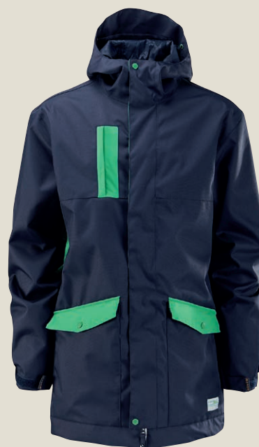
1007: IN THE NAVY