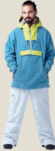
Fox Overhead [page 11]