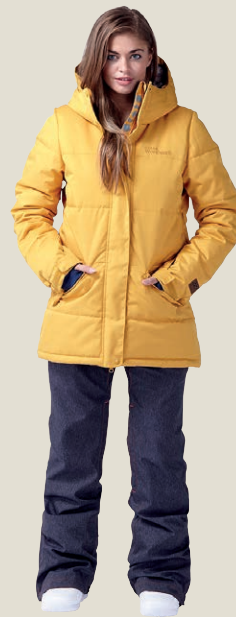
Bayshore Puffer [page 35]