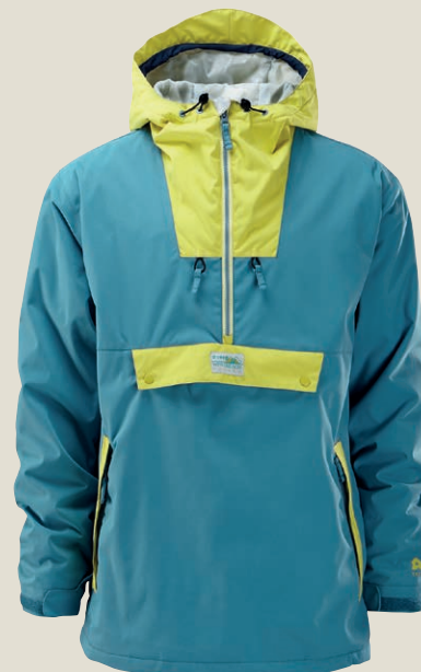
1063: ENDLESS BLUE