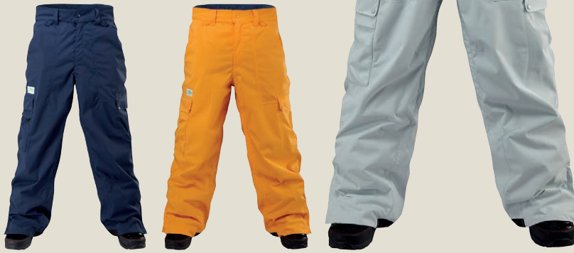
1007: IN THE NAVY