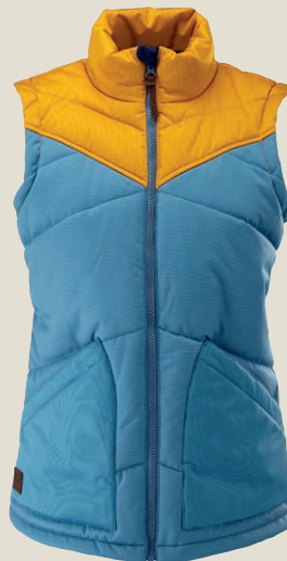
1063: ENDLESS BLUE