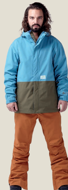
McFly Jacket [page 14]