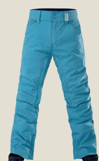
1063: ENDLESS BLUE