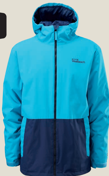
1082: SINATRA BLUE