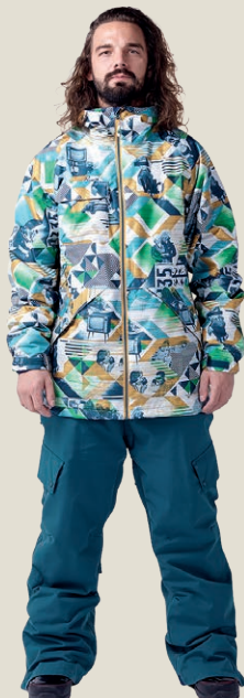
Ego Spectrum Jacket [page 13]