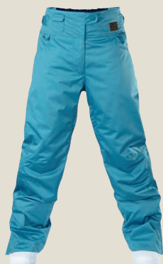
1063: ENDLESS BLUE