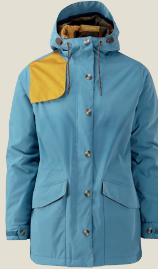
1063: ENDLESS BLUE