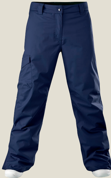
1007: IN THE NAVY