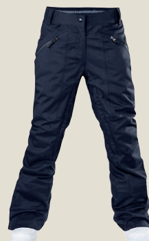
1007: IN THE NAVY