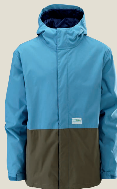
1063: ENDLESS BLUE