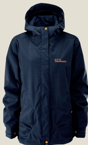
1007: IN THE NAVY