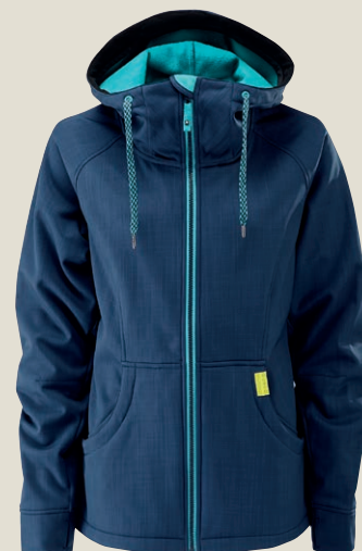
1007: IN THE NAVY