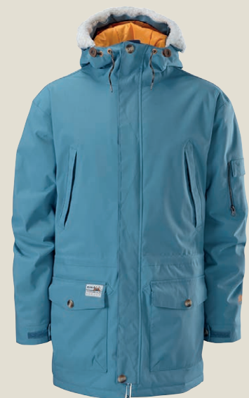
1063: ENDLESS BLUE