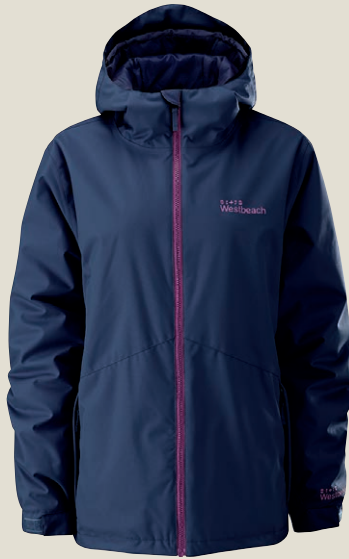
1007: IN THE NAVY