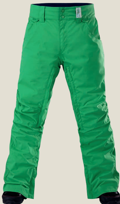
1039: BEER BOTTLE