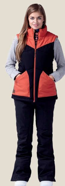
Varenes Vest [page 35]