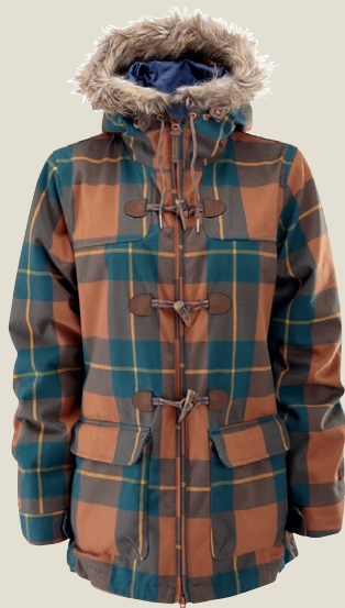
1174: RUSTY PLAID