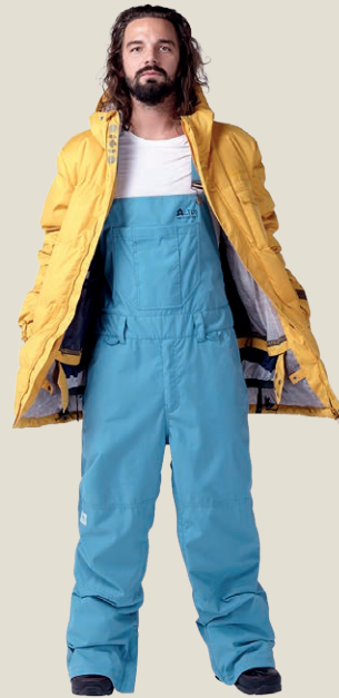
Cambie Puffer [page 21]