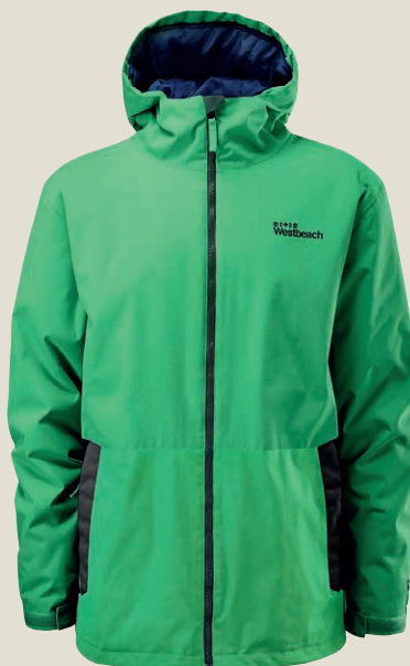
1039: BEER BOTTLE