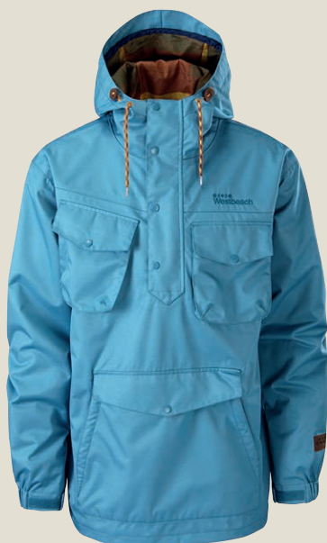
1063: ENDLESS BLUE