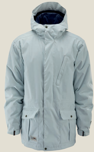
1054: VANCOUVER SUN