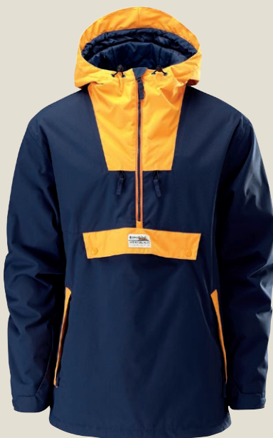
1007: IN THE NAVY