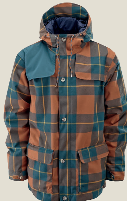
1174: RUSTY PLAID