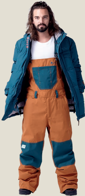
Cambie Puffer [page 21]