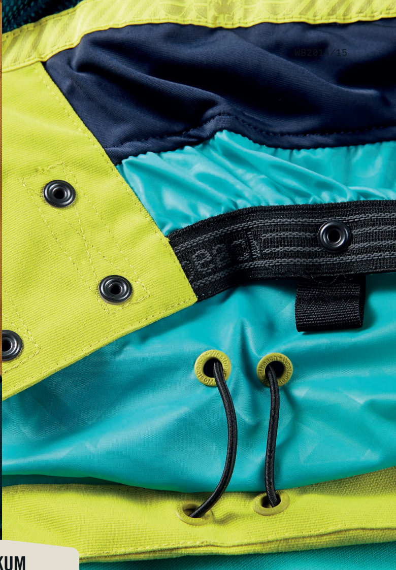
TOKUM - JACKET -