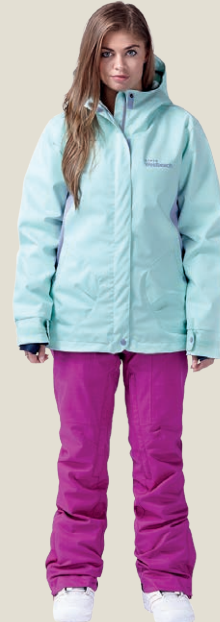
Hill Valley Jacket [page 26]