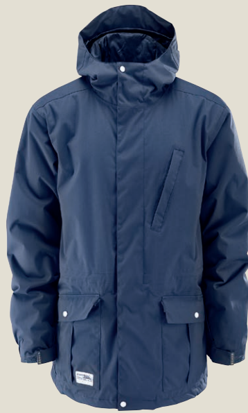
1007: IN THE NAVY