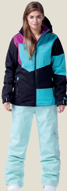
Gigawatts Jacket [page 26]