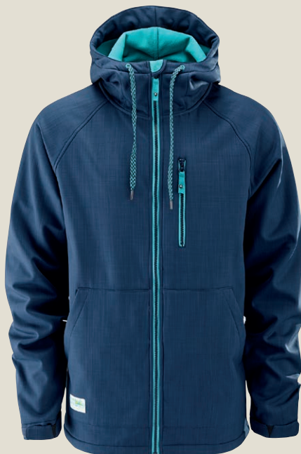
1007: IN THE NAVY