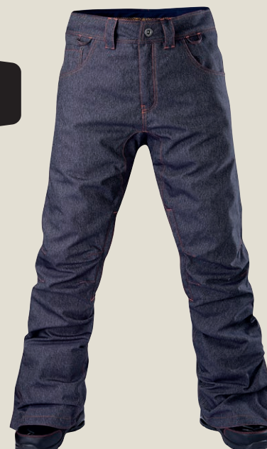
1041: INDIGO DENIM