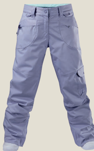
1051: DIGITAL CLOUD