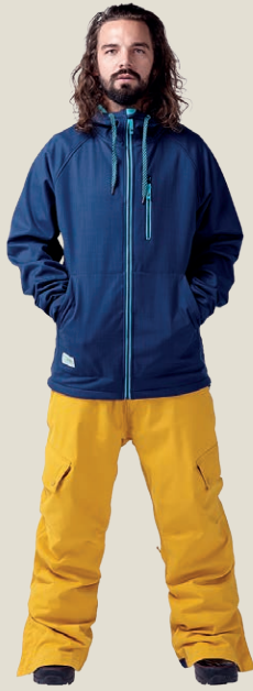
Baines Softshell [page 12]