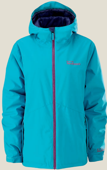
1082: SINATRA BLUE