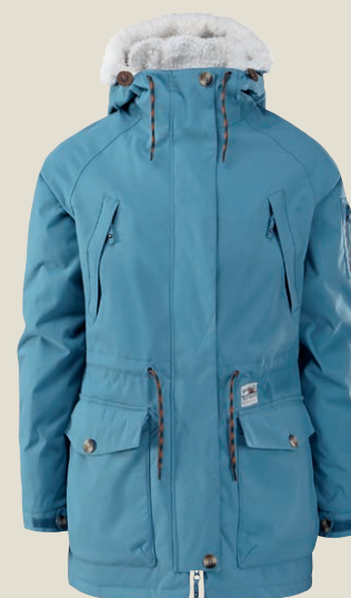
1063: ENDLESS BLUE