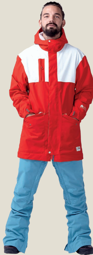
Emmet Jacket [page 11]