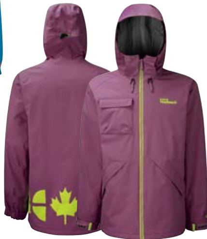
Langley / Aprí Acid