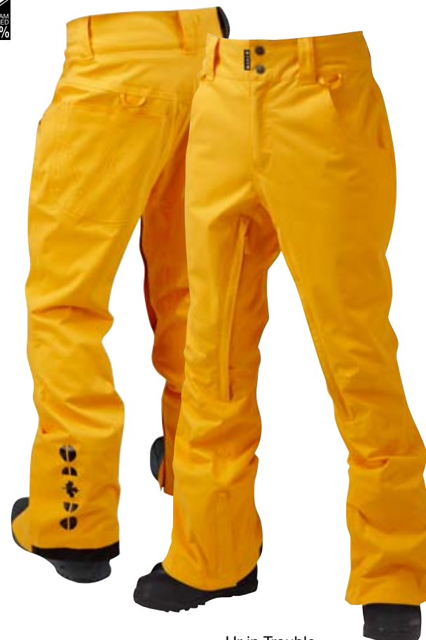
Ur in Trouble