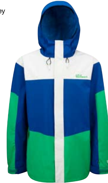
Blue Ice / Cream Soda / Beer Bottle