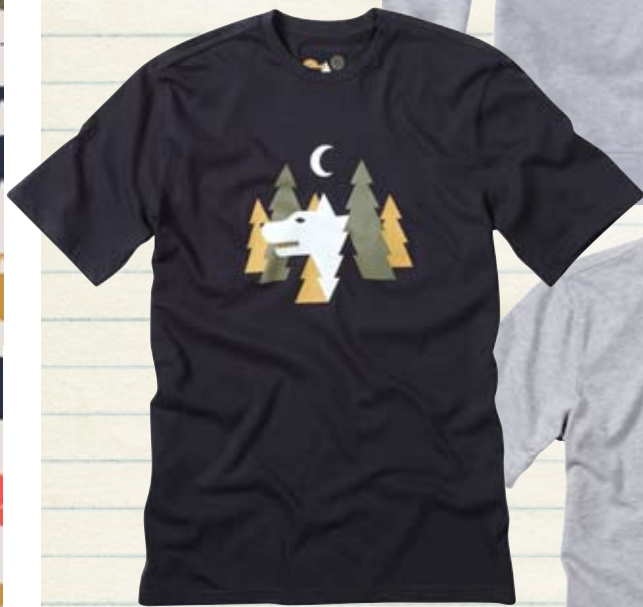
4028 Wolf T-shirt (mens)