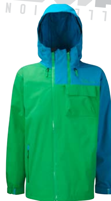
Sinatra Blue / Beer Bottle