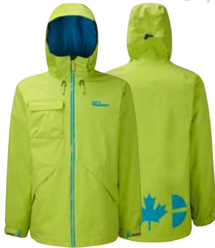
Poison / Sinatra Blue