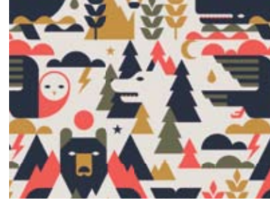
Exclusive Print Lining