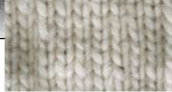
Printed knitted texture lining