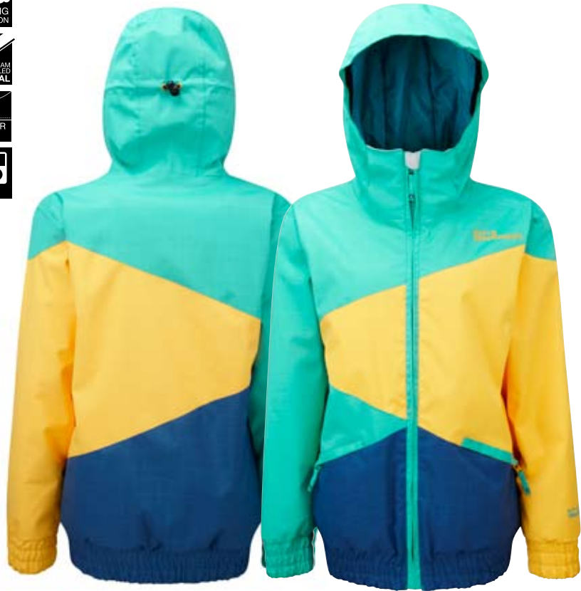
Anti-Establishmint / Ur in Trouble / Blue Ice