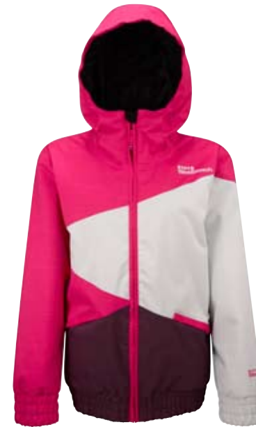
Betty Berry / Spray / Langley

For mornings of foggy windshields and days of deep drifts, ride restriction-free in this bomber-fit coat that blends lightweight warmth with a sporty colour-blocked vibe.