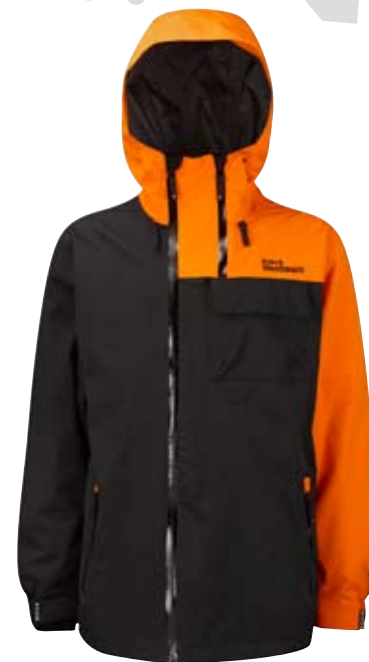
Apri Acid / Black