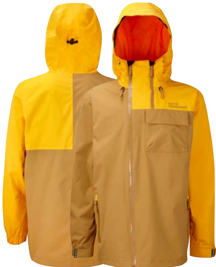
Ur in Trouble / Pargnar