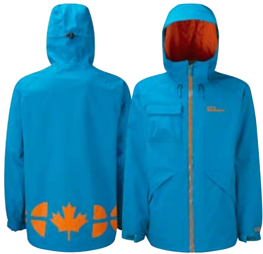
Sinatra Blue / Aprí Acid