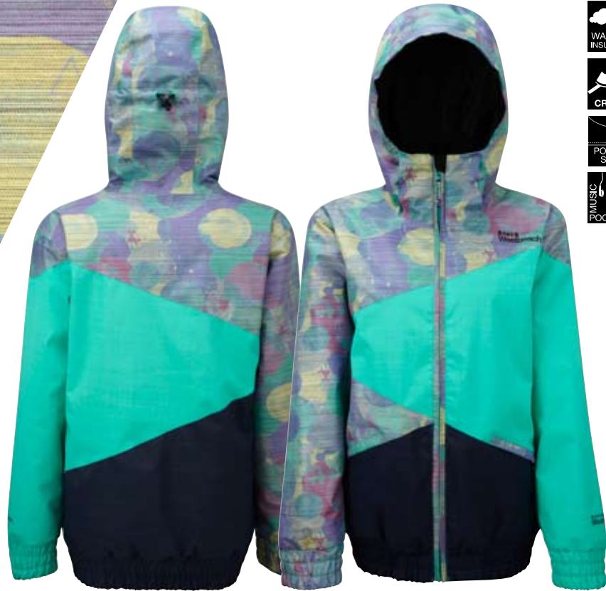
Planet Print / Anti-Establishmint / Inthe Navy