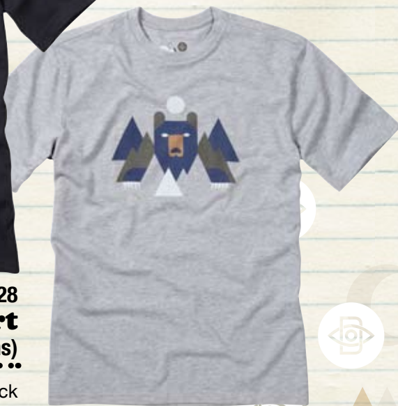
4029 Bear T-shirt (mens)