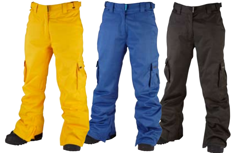
Ur in Trouble / Blue Ice / Black

The perennial Westbeach favourite is back again to dominate Old Man Winter. With fit and form for snow and street, plus cargo pockets for all the necessities, these pants offer the best bang for your buck.