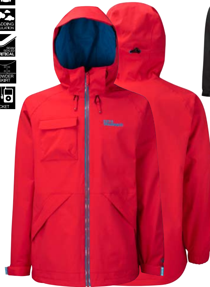
Clamato Red / Sinatra Blue