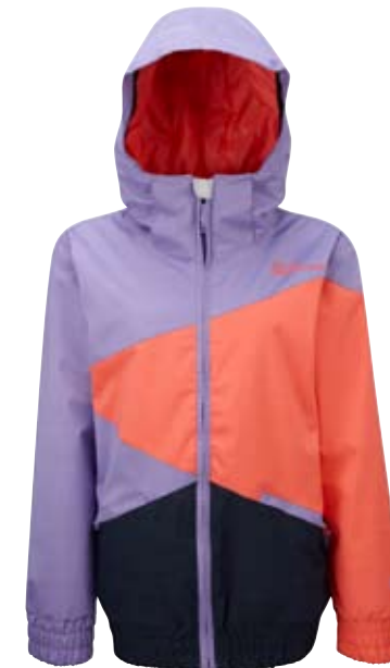
Shallow Purple / Carmela / Inthe Navy