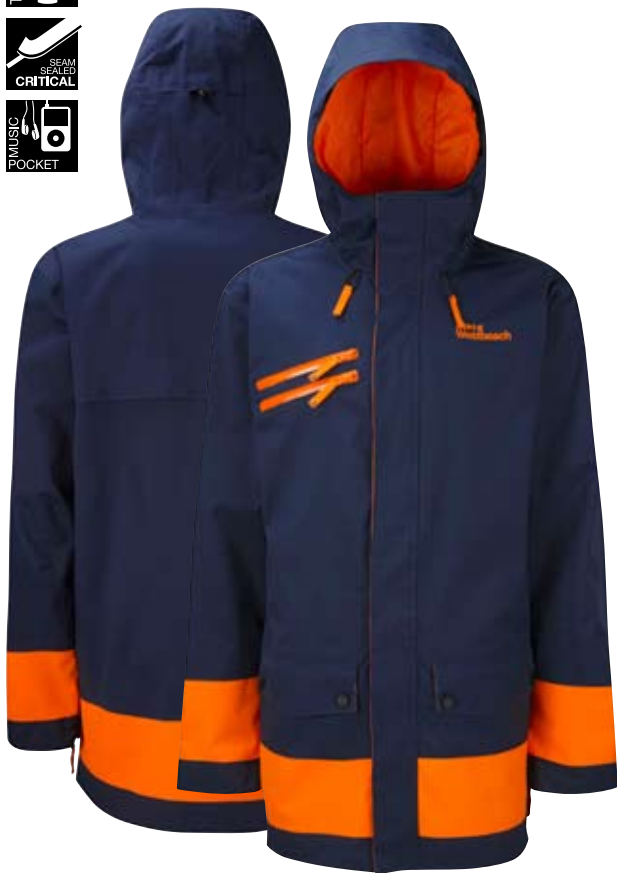
Inthe Navy / Apri Acid