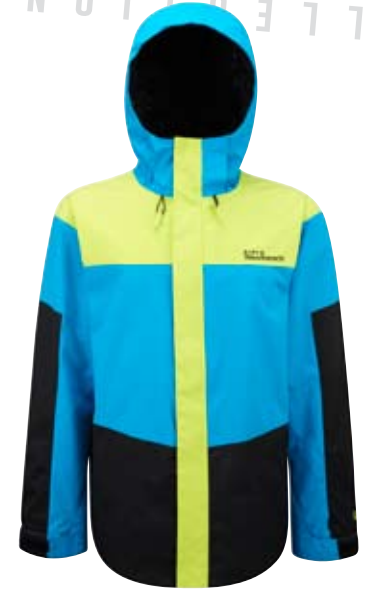
Sinatra Blue / Poison / Black