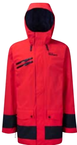
Clamato Red / Inthe Navy