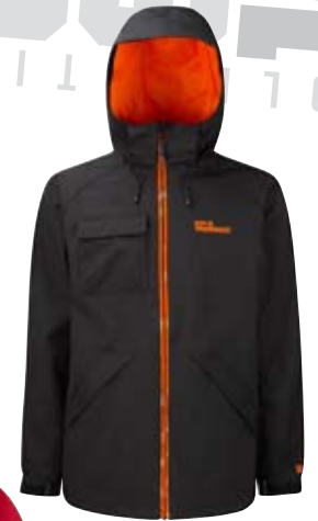
Black / Aprí Acid