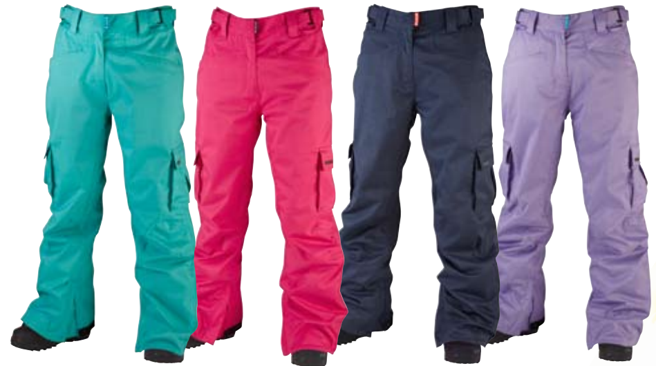
Anti-Establishmint / Betty Berry / Inthe Navy / Shallow Purple