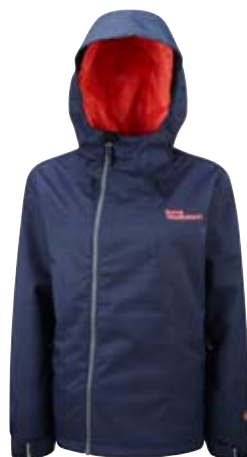
1007 Inthe Navy