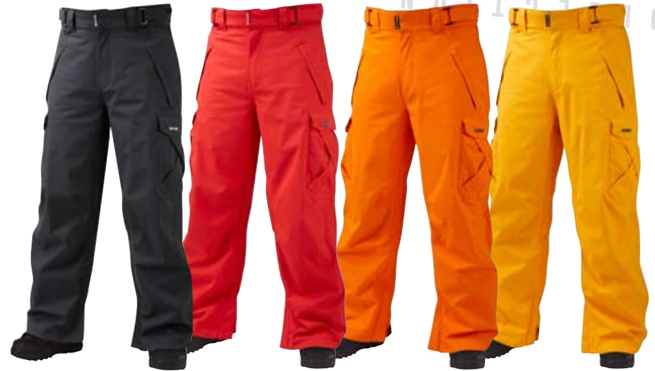
Black / Clamato Red / Apricot / Ur in Trouble