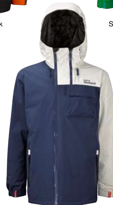
Cream Soda / Navy