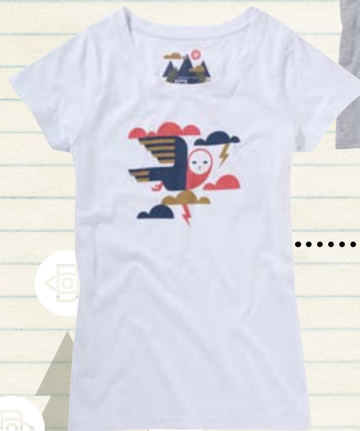
4031 Owl T-shirt {ladies}