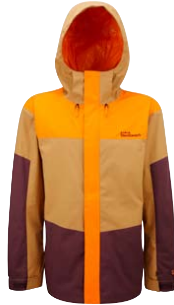
Pargnar / Apri Acid / Langley