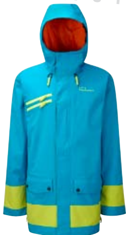
Sinatra Blue / Poison