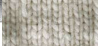
Printed knitted texture lining