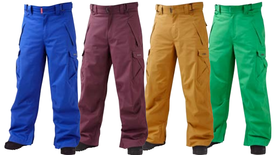
Blue Ice / Langley / Pargnar / Beer Bottle