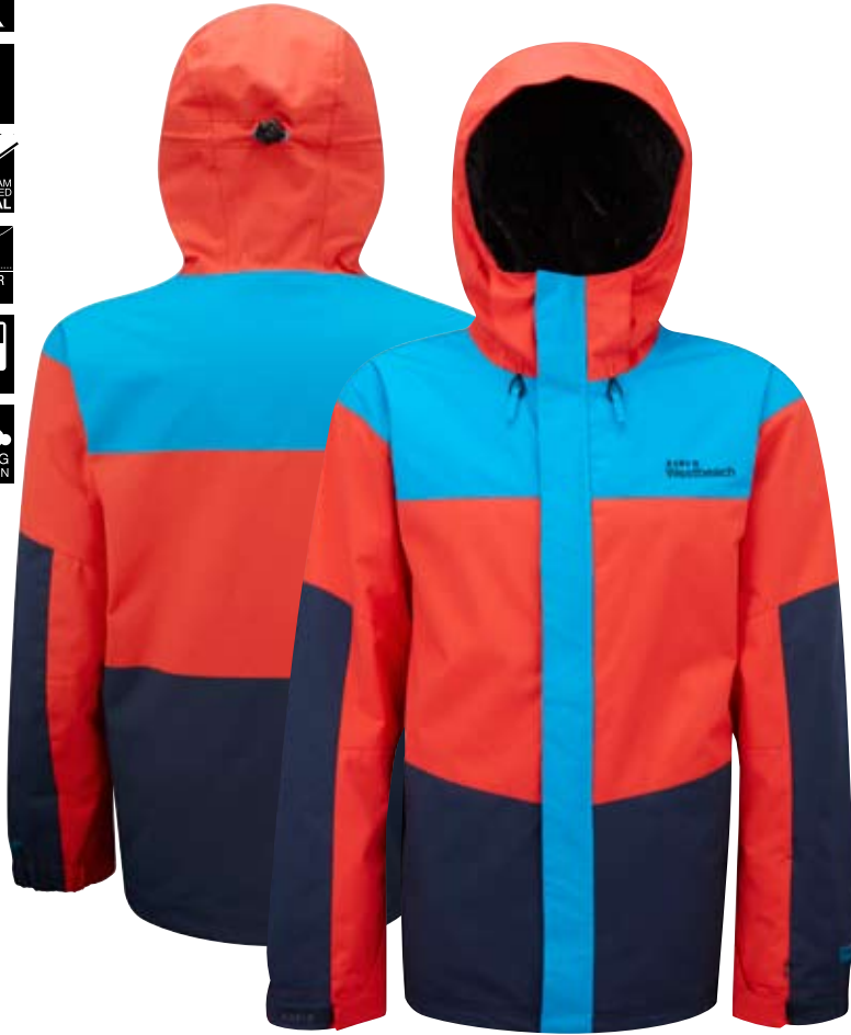
Clamato Red / Sinatra Blue / Inthe Navy