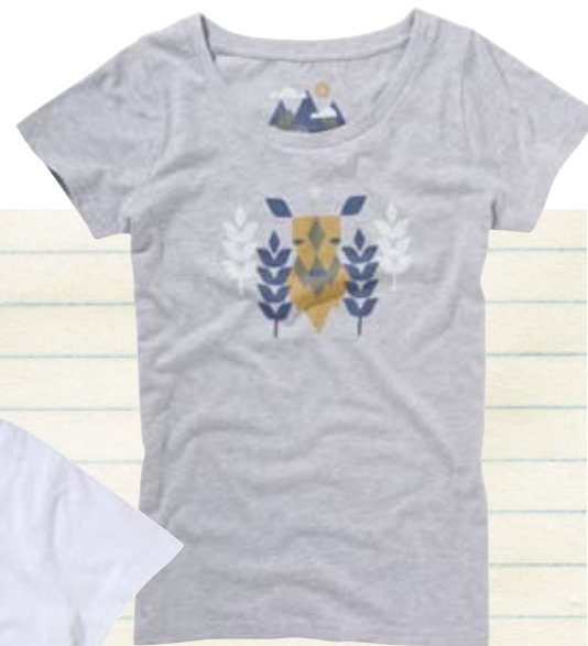
4032 Deer T-shirt {ladies}